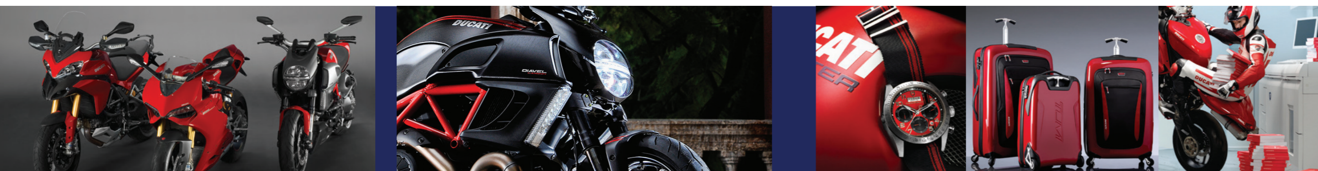
From left: the Multistrada 1200 S Touring (Best All-Rounder), the 1199 Panigale (Best Sport Motorcycle) and the Diavel Cromo (Best Naked Motorcycle)