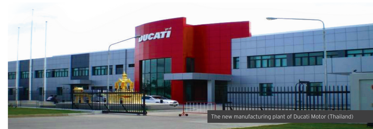
The new manufacturing plant of Ducati Motor (Thailand)

During 2011 Ducati continued to develop significant brand alliances with leading players in their respective fields such as Xerox, Tudor and Tumi.