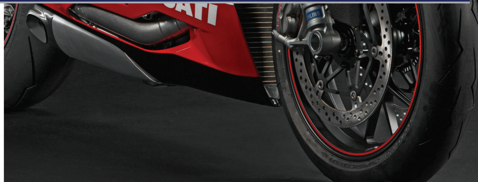
The new 1199 Panigale S Tricolore was presented in November 2011 at the EICMA International Motorcycle Show in Milan

These actions enabled Ducati to weather the economic downturn well and to more than double its market share over the last five years. Ducati reinforced its distribution network and further enlarged its international footprint: new exclusive stores and multi-franchise dealers were opened and the company also reinforced its presence in selected emerging markets.