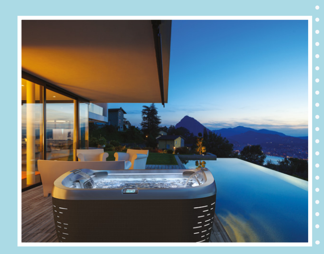
Jacuzzi Brands showed strong resilience, and consumer demand throughout the pandemic.

"Investindustrial's strategic support in developing and executing the growth strategy of the Company has been crucial since its entry in Jacuzzi. In particular during the pandemic, the responsible investment approach of Investindustrial has allowed us to emerge from this period as a stronger and leaner organisation".